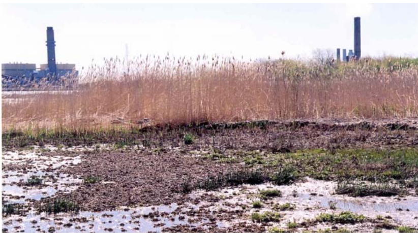
Phragmites dominates the former beach at Bay City State Recreation Area, once the state's most popular beach

Thanks to a late-hour amendment advocated by SOS, phragmites was added to a list of biological materials that are prohibited in Michigan. As a result of the passage of 2005 PA 77, it is now illegal to propagate or spread phragmites in Michigan. SOS was able to act promptly on this bill thanks to our excellent relationship with state lawmakers made possible by our Political Action Committee Fund, and our government relation counsel-